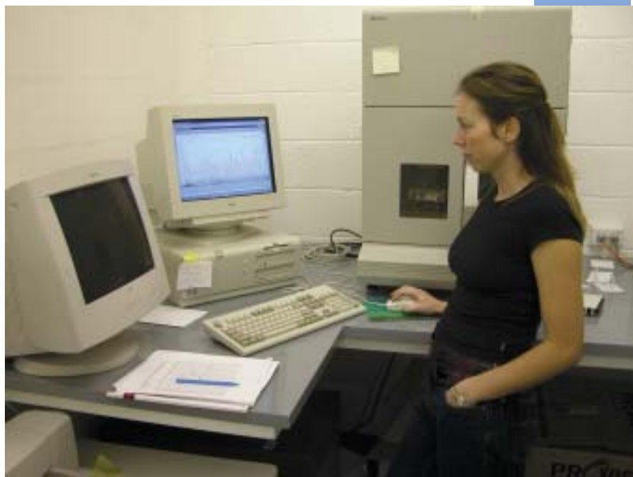
The sequencing lab at UTas – about the only lab without a view.