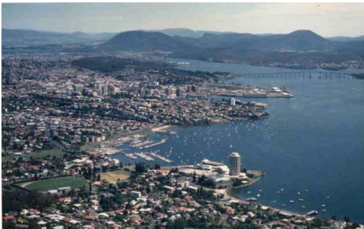
The biochemistry labs at UTas have a five star view across the Derwent River.

There were several things that struck me about Adelaide that first summer – the heat and the scientific environment – not necessarily in that order. The research environment at the Hanson Centre was a very different experience than I was used to, with the research driven by postdocs rather than students, as is usual in a university department. It was also a great collaborative environment with